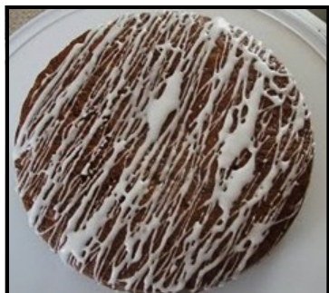
Spiced Carrot Cake $20