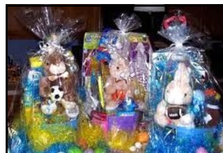
Custom Easter Baskets (prices vary)