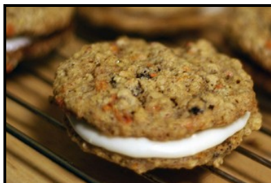
Carrot Cake Whoopie Pies $18/dozen