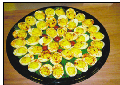
Deviled Eggs (spicy or regular) $12/dozen