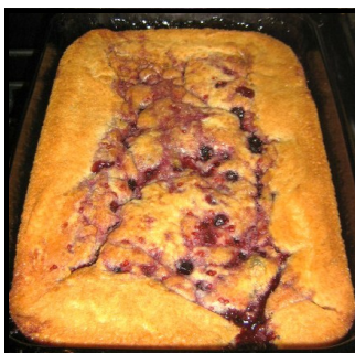
Berry Cobbler $20