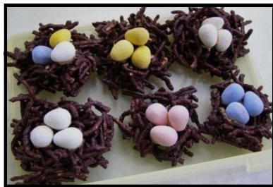
Chocolate Peanut Butter Nests $15/dozen